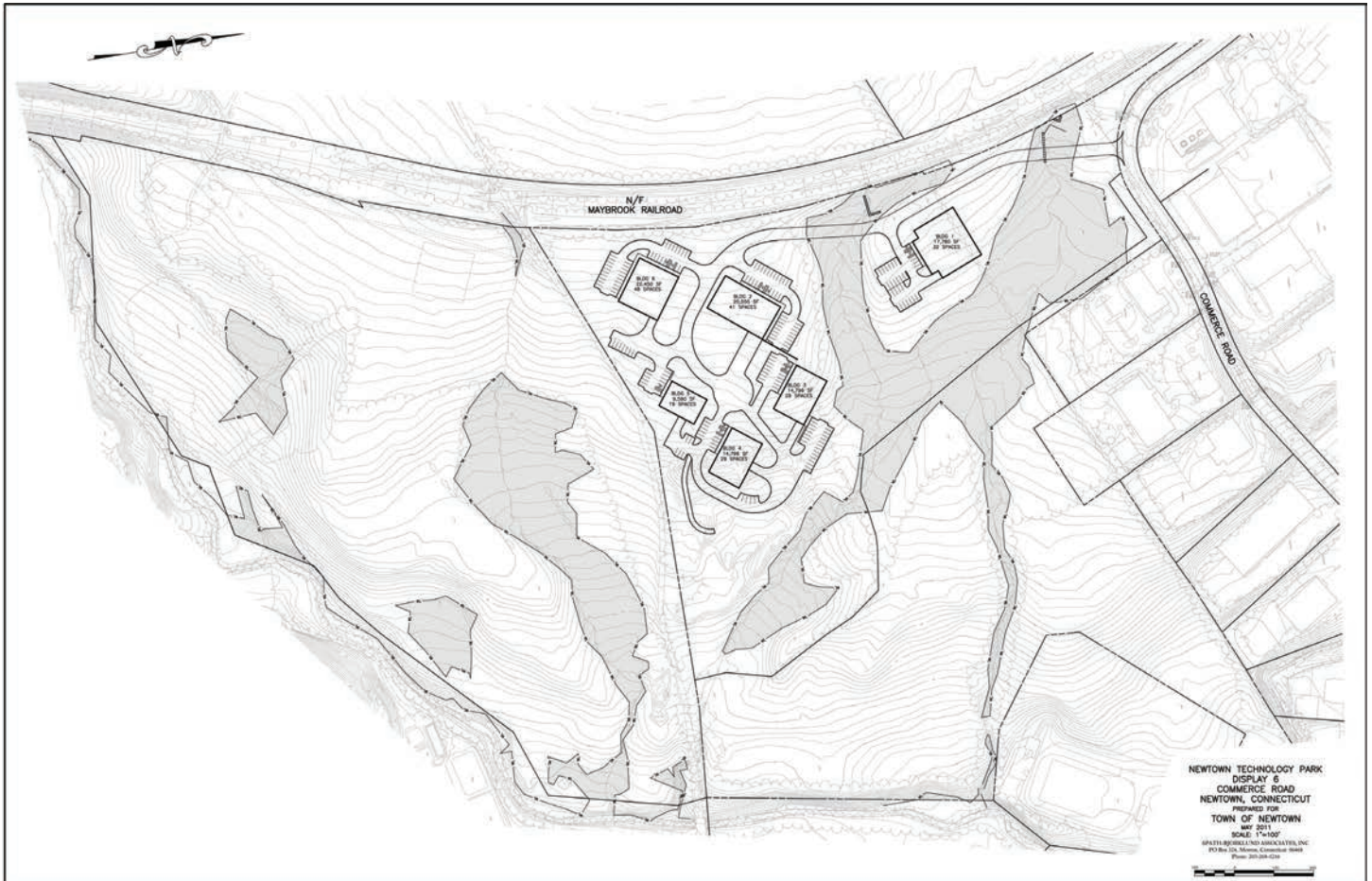
Site Concept Plan

The Town of Newtown is the owner of this beautiful 23 acre development parcel. The Economic Development Commission is seeking to have the site transformed into a thriving technology-based campus. Located immediately off Exit 10 of I-84 in Newtown, Connecticut the Town of Newtown is offering the land for sale or lease. Incentives are available from the Town of Newtown. Utilities are in place on Commerce Road. The site development concept has been approved by the Newtown Inland Wetlands Commission.