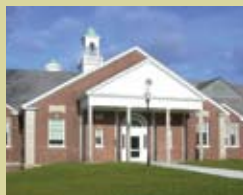
Newtown Municipal Center