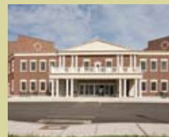
Newtown Youth Academy